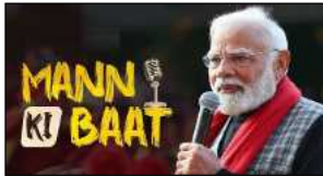
hydrated. If you need to step out in the sun, do so cautiously and take necessary precautions," he said. "Keep drinking water. Don't forget the guidelines

NEW DELHI, May 31: Prime Minister Narendra Modi on Sunday urged people to stay hydrated in view of soaring temperatures across the country. In his monthly radio broadcast Mann Ki Baat, he said people should take extra precautions when stepping out in the sun. "With temperatures soaring across much of the country, it is important to take extra care. Stay